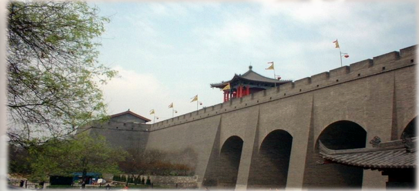
The City wall