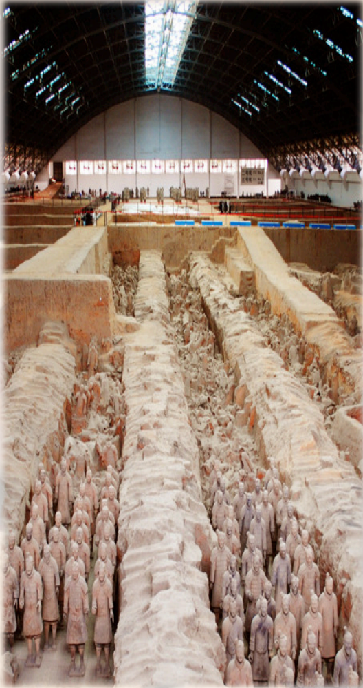
Qin Terra-cotta Warriors and Horses