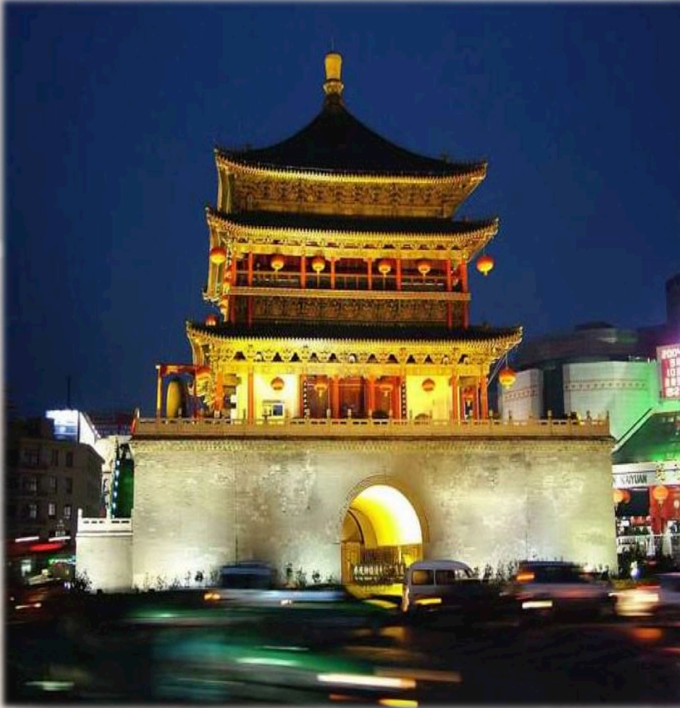
The Bell tower at night