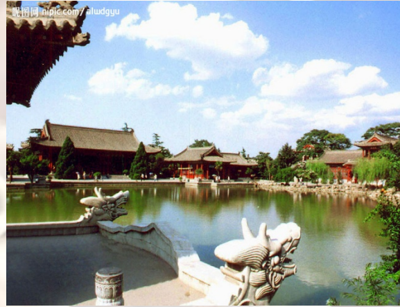
Huaqing Hot Springs