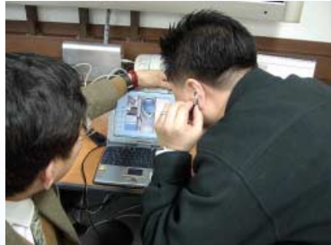
Taiwan ITRI & Korea NCA VoIPv6 service testing