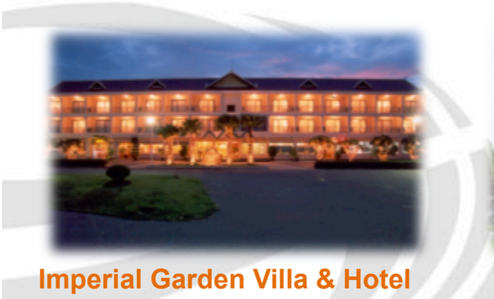
Imperial Garden Villa & Hotel