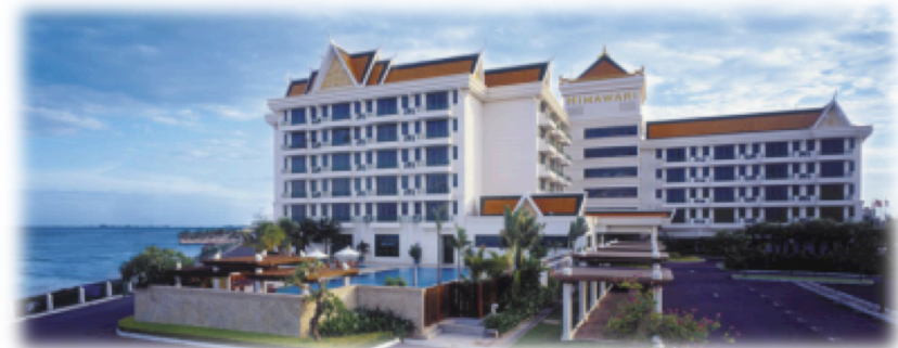
Himawari Hotel Apartments