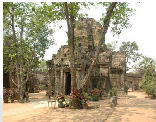
Ta Prohm - Tonle Bati lake