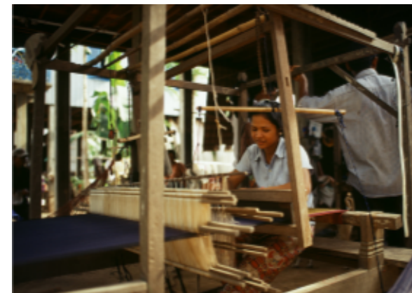
Koh Dach Silk Island